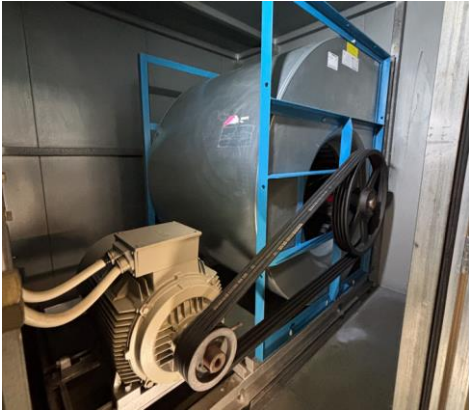
Image 1: Old belt-driven AC fans are still widely used in existing buildings, but they require a lot of maintenance and consume a lot of energy.