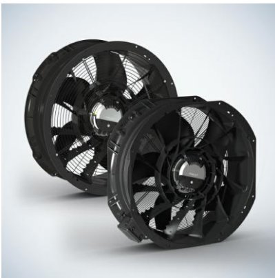
Image 2: New AxiBlade.Perform fan for increased airflow and flexible installation.