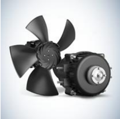
Image 1: The new iQx is available both as an OEM component and as a plug-and-play-compatible complete system with matching axial impellers in diameters of 172, 200, 230 and 254 mm.