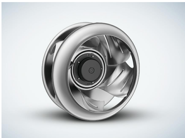
Fig. 1: RadiPac EC centrifugal fans from ebm-papst are specially designed for filter-fan-units in cleanrooms. The newly developed impeller with its five geometrically sophisticated impeller blades drastically reduces flow losses.

Corinna Schittenhelm +49 7938 81-8125 Corinna.Schittenhelm@de.ebmpapst.com