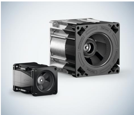
Fig. 2: New sizes available: DiaForce 40 (left) and DiaForce 80 (right).