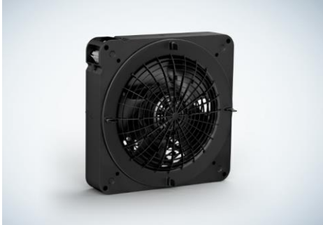
Fig. 1: New diagonal compact module for control cabinet filter fans.