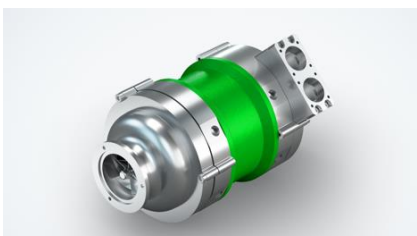
Fig. 3: Oil and vibration-free as well as low-wear: the compact high-speed platform P2 compressor.