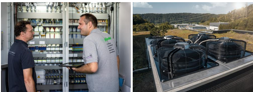
Fig. 1 a/b: Switching to more intelligence: ebm-papst is opening its own doors to a whole world of digital added value. Gateways, intelligent fans, and the epCloud all add digital value.

twitter.com/ebmpapst_news facebook.com/ebmpapstFANS youtube.com/ebmpapstDE www.ebmpapst.com