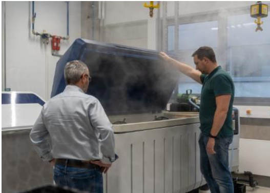
Image 4: The quality of the coatings and materials is investigated in the salt spray test chamber.

Characters approx. 2,900, including headings and sub-headings Tags Testing center, test bays, validation, quality assurance, quality, product safety, EC technology, axial fan, centrifugal fan, environmental influences Link https://mag.ebmpapst.com/validation