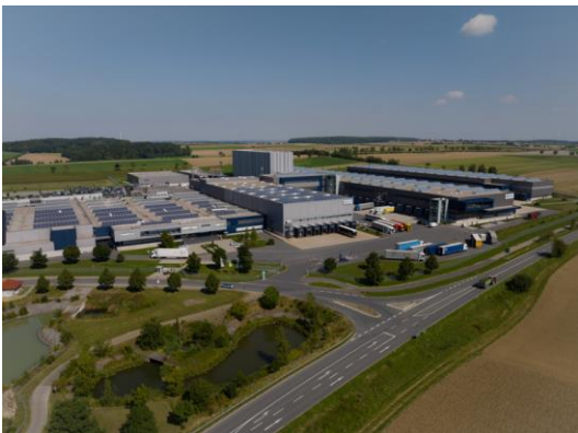
Image 2: All validation and testing capacities at the headquarters are centralized in the new testing center.