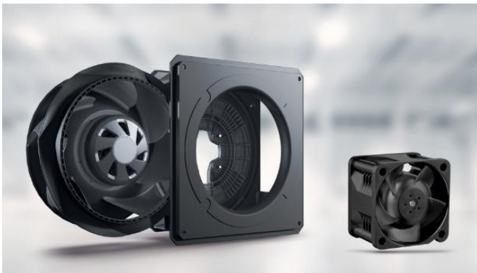
Fig. 1: The RadiCal 2 and AxiForce 40 compact fans are perfect for the requirements of control cabinet and electronics cooling.

twitter.com/ebmpapst_news facebook.com/ebmpapstFANS youtube.com/ebmpapstDE www.ebmpapst.com