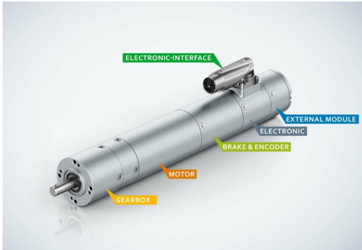
Fig. 1: Modular drive system: All individually selected drive components are placed in a common housing.