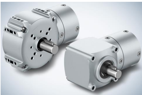
Fig. 3: EtaCrown and EtaCrownPlus are part of the modular drive system from ebm-papst and can be combined with all DC and EC motors as well as brakes and encoders.