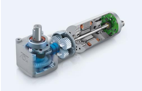
Fig. 1: The involute drive pinion in the crown gearbox is cylindrical in shape and the contact between the pinion and output gear is a rolling contact. Hardly any friction losses occur.