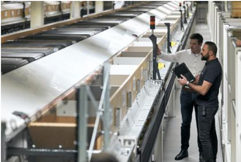
Image 1: The 275-meter-long production facility from the BEUMER Group in the logistics center in Weiden sorts of over 10,000 items per hour.