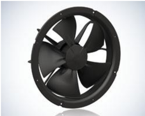
Image 1: Energy-saving motor (ESM) for installation in refrigeration and freezing applications under shelves – energy saving and with speed control.

Katrin Lindner Trade press coordinator Phone: +49 7938 81-7006 Katrin.Lindner@de.ebmpapst.com