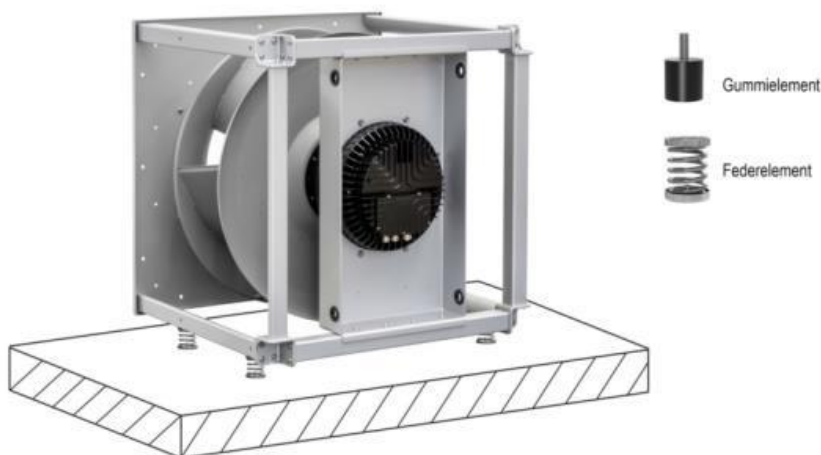
Picture 2: Vibration-absorbing elements, i.e. appropriately designed springs or rubber elements, help to isolate the fan from vibration in the surrounding area.

Pictures ebm-papst Characters approx. 2,600, including headings and sub-headings Tags EC fans, Vibration measurement, Fan set-up, Vibration-absorbing elements, Vibration sensor, Service life Link www.ebmpapst.com