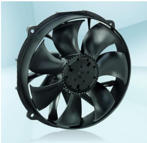
Figure 1: The robust axial fan from ebm-papst for motor cooling is highly resistant to grime deposits.

Phone: +49-7938-81-7105 presse@de.ebmpapst.com twitter.com/ebmpapst_NEWS facebook.com/ebmpapstFANS youtube.com/ebmpapstDE www.ebmpapst.com www.greentech.info/ec-technologie