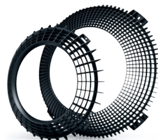
FlowGrid air inlet grill Optional

See data sheet for dimensions and connections