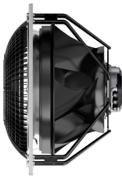
RadiFlow EC centrifugal fans Support bracket with FlowGrid