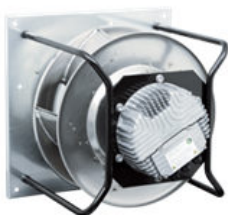
EC centrifugal fans – RadiPac support bracket Sizes 355 - 400