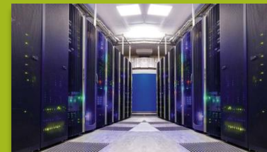
ITC and the electronics industry