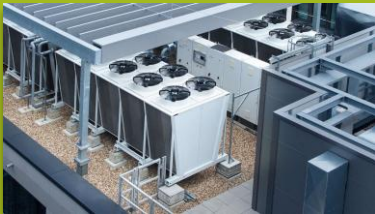
Air Conditioning Technology