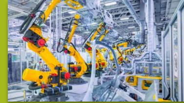
Machinery and Systems