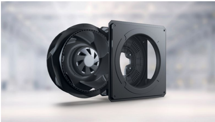
Fig. 3: RadiCal 2 EC centrifugal fan, ideal for ventilation