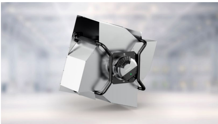
Fig. 2: RadiPac C Perform EC centrifugal fan, ideal for air handling units