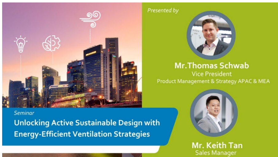
Fig. 4: BEX Asia 2023 Seminar by ebm-papst SEA

Characters Approx 6,400, including headings and subheadings Tags Air conditioning, ventilation, sustainability, exhibition, product news Link ebmpapst.com/sg/en/newsroom/news/2023/bex-asia-2023.html