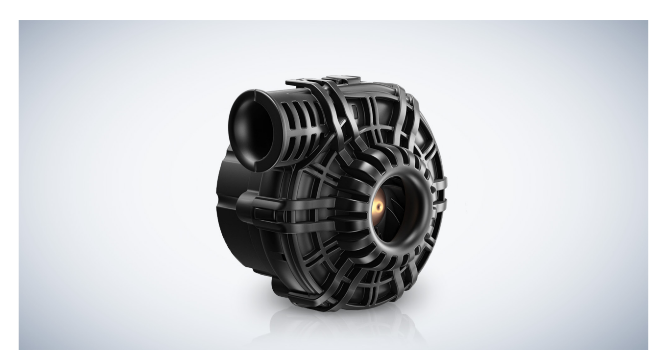
Fig. 1: The RV45 offers highly available, efficient and quiet air delivery (actual size).

The reliability of medical devices and their components is particularly important. Particularly when using apnea machines at home or as a ventilator in the intensive care unit, simple operation is also important. If, for example, a ventilator is used during sleep, such a device must be located close to the user and must not interfere with healthy sleep due to operating noises. In order to meet these requirements, the fan and drive specialist ebm-papst from St. Georgen in the Black Forest developed the RV45 radial fan for ventilators and similar dynamic applications that meets these requirements - safe, reliable, efficient and quiet (Fig. 1).