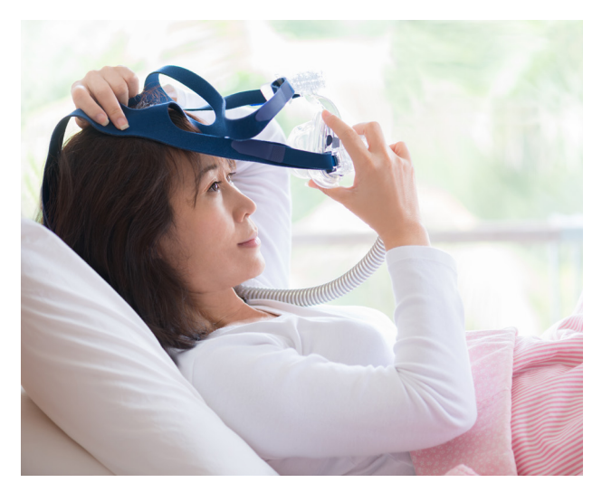
Fig. 4: If the fan is installed in a suitable, noise-damping device housing, no disturbance is to be expected even at night.

The RV45 is very compact with only 64 x 69.5 x 54.5 mm and is available for operation on two voltages 12 and 24 VDC. The power consumption is around 43 W in free blowing operation, but running in typical applications with speed control can often average 20 W lower, which also ensures long running times in battery operation. The possible high power consumption is indispensable for the short-term "sprint" in order to fulfill the requirements on high dynamic operation. The maximum free blowing air flow is up to 410 l/min and the maximum pressure increase is over 5,000 Pa (Fig. 3). This is sufficient for large lung volumes, heavy soft palate cases or for use in secretion mobilization. All wetted air-contacting parts of the 135g light-weight fan are constructed from FDA compliant OK materials which are harmless to human respiratory physiology. Thanks to the selected vibration damping materials and the optimized aerodynamic design, the operating noise is minimized and is at a level similar to a whispering conversation. Built into a suitable, sound-absorbing housing, any sleep disturbance will be minimal (Fig. 4).