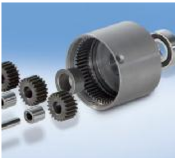
Fig. 1 Reinforced output stage of the planetary gearboxes

In combination with the high-torque, durable drives in energy-efficient GreenTech EC technology from ebm-papst, optimally matched motor/gearbox combinations can be created for especially high service life requirements or dynamic applications with increased peak loads. With nominal output powers of up to 400 W ever more new drive solutions can be created for many different applications, e.g. in industrial automation, intralogistics or medical technology.